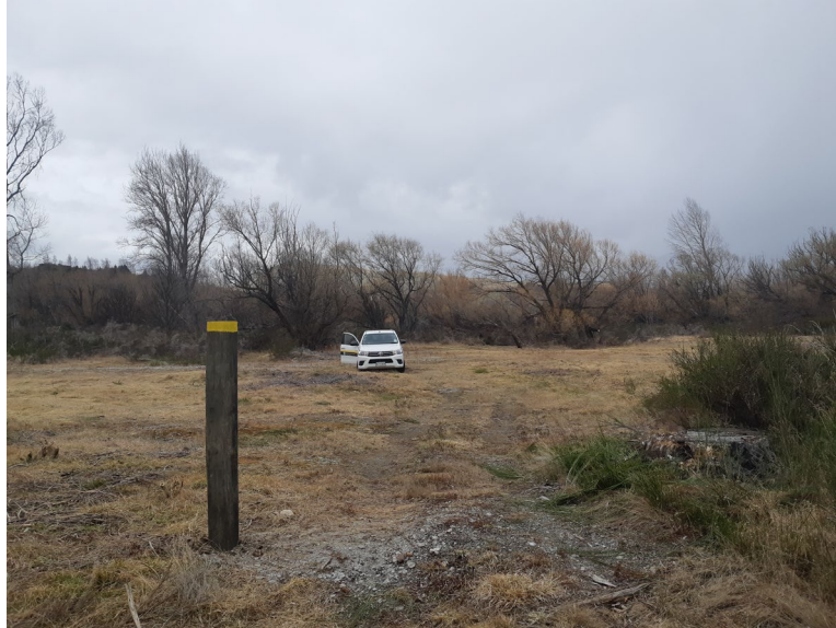
Photo 3 – Yellow topped post marking western boundary entrance from marked vehicle access track