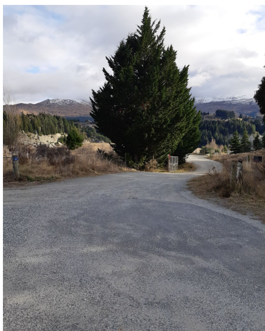
Photo 1 – Entry into Tuckers Beach Reserve from Tuckers Beach Road.