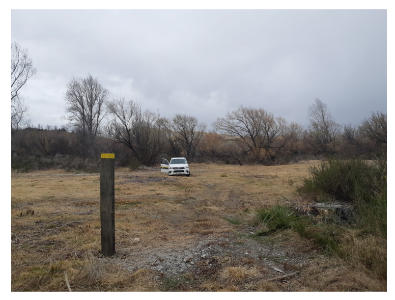
Photo 3 – Yellow topped post marking western boundary entrance from marked vehicle access track