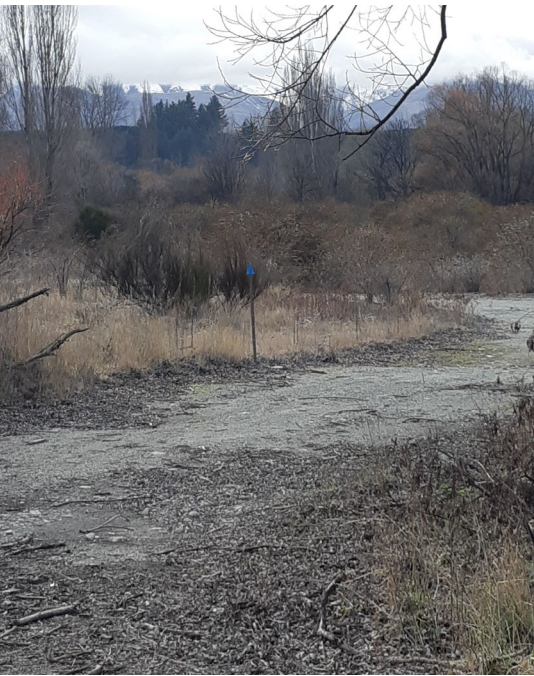
Photo 2 – Blue waratahs marking vehicle access route to nohoanga site.