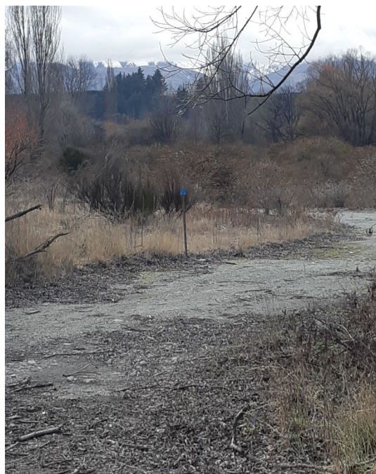
Photo 2 – Blue waratahs marking vehicle access route to nohoanga site.