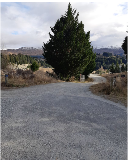
Photo 1 – Entry into Tuckers Beach Reserve from Tuckers Beach Road.