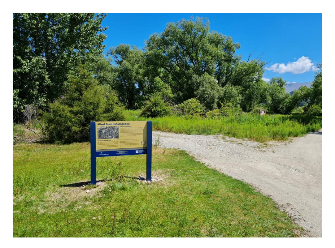
Entrance to the Albert Town nohoanga