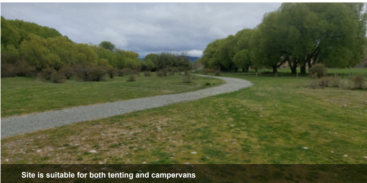
Site is suitable for both tenting and campervans