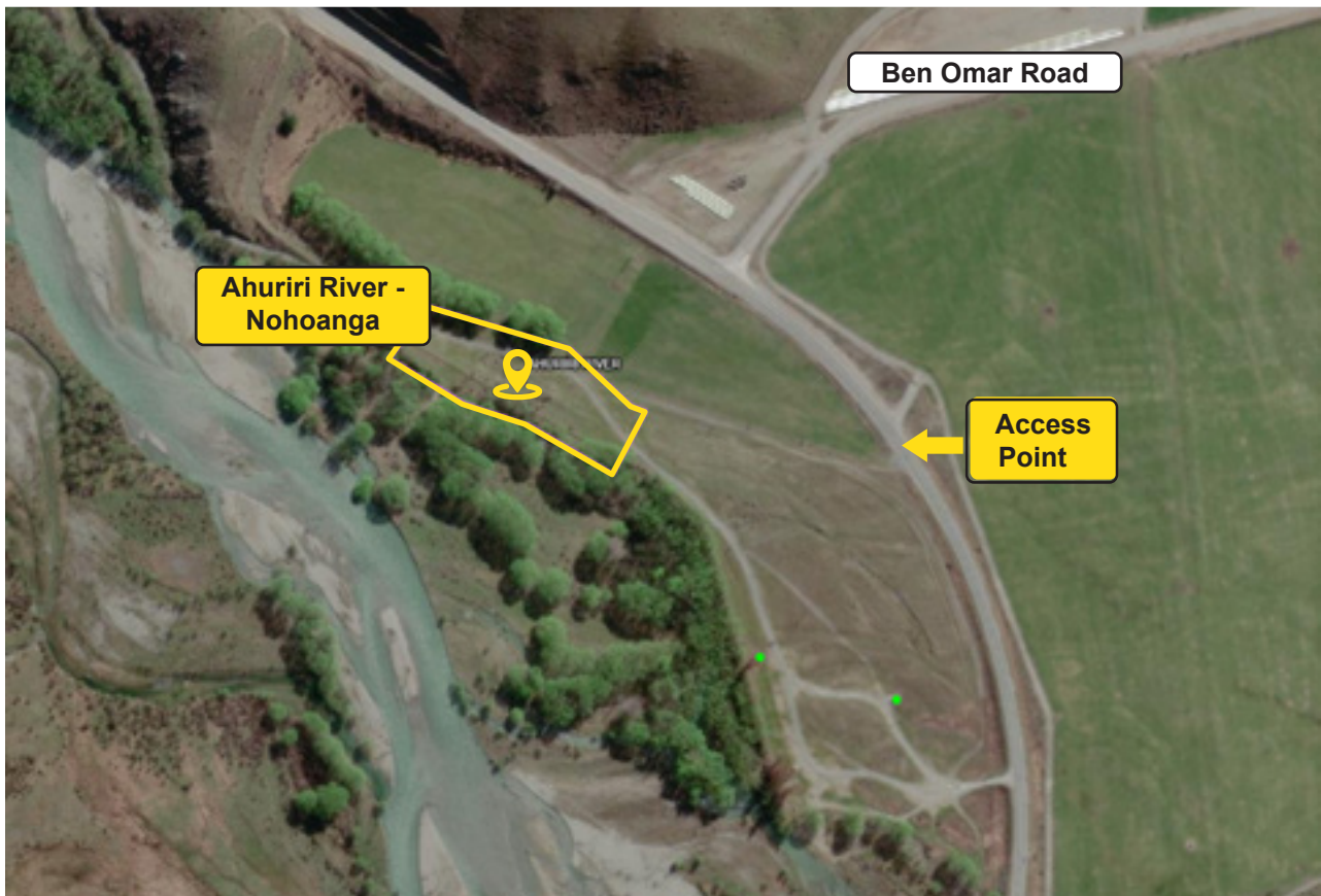
Site access point from State Highway 8 / Twizel-Omarama Road