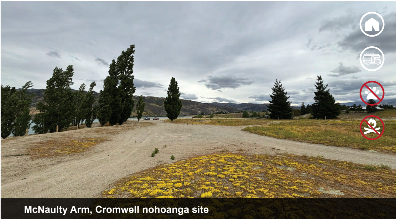
McNulty Arm, Cromwell nohoanga site