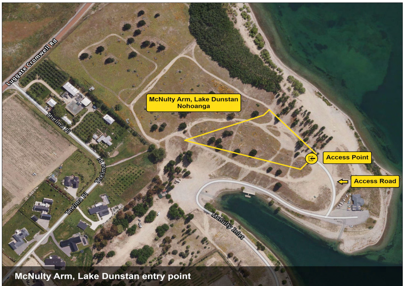
McNulty Arm, Lake Dunstan entry point