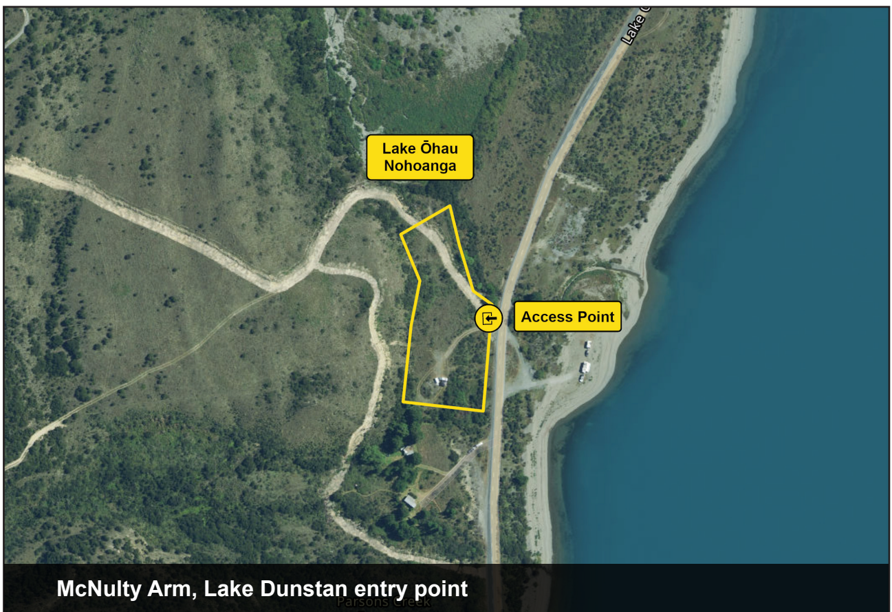
McNulty Arm, Lake Dunstan entry point