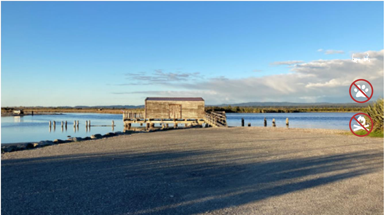
Ōkārito Lagoon camping site