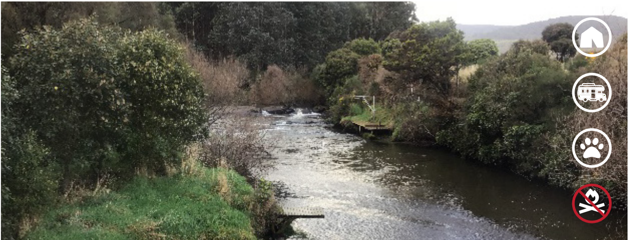
Camping site - Waikawa river