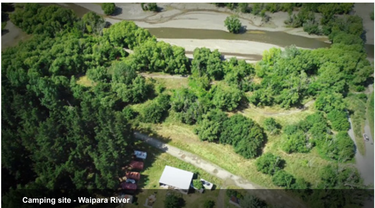
Camping site - Waipara River