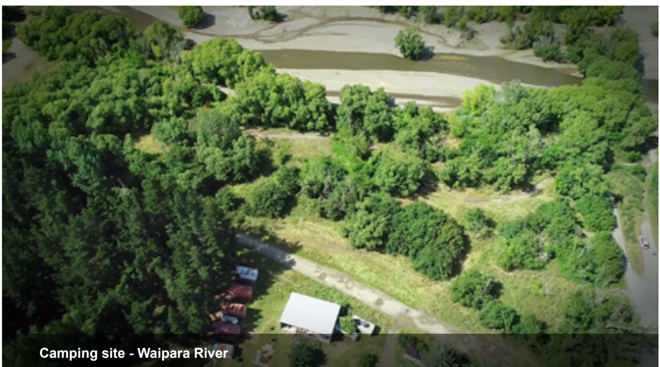
Camping site - Waipara River