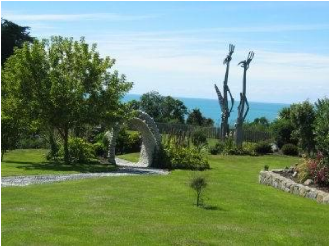
Hine Nui te Po (Stone Archway) [Gathering site for emergencies] Kahukura & Marokura (the 2 Pou to the rear)

We hope this information package will provide some answers to any queries you may have. If you have any other questions or points of clarification before or during your time at the Marae, please do not hesitate to contact the Rūnanga office or speak with any of the Marae whānau who may be present on the day.