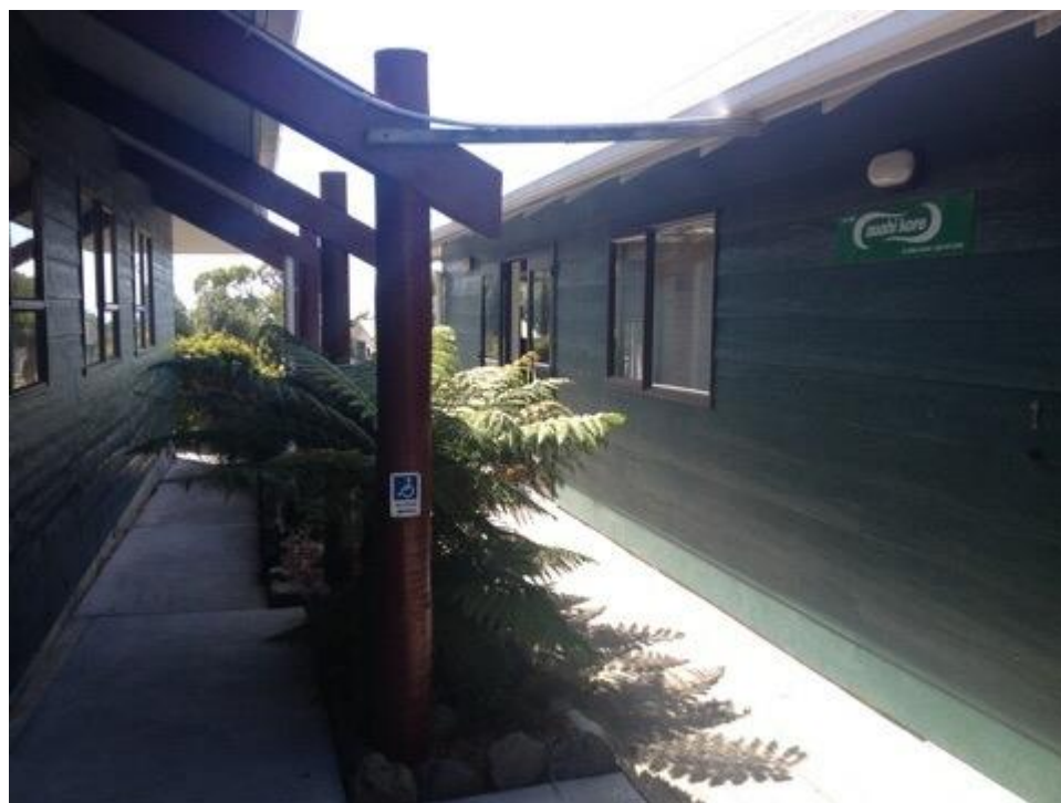
Office of Te Rūnanga o Kaikoura [back office]

The Office of Te Runanga o Kaikoura is situated at Takahanga Marae. The Runanga Office is responsible for the management of Runanga Policy and Directives while the Runanga itself is responsible for the governance of Runanga Policy and Direction. The Runanga meets every second Sunday of the month, February - November.